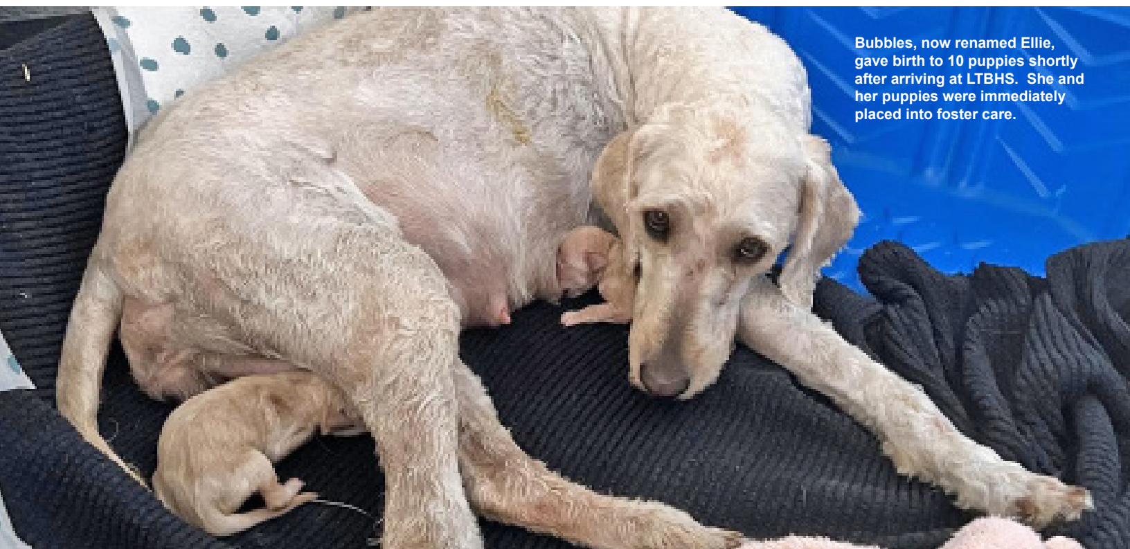
Bubbles, now renamed Ellie, gave birth to 10 puppies shortly after arriving at LTBHS. She and her puppies were immediately placed into foster care.

Puppies, which are the most sought-after animal in shelters, can be found in most shelters across the country. Even purebred pups can be found with time and patience. In this