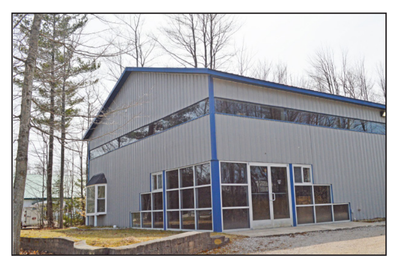
8580 Commerce Court, Harbor Springs.

Want more information about our services including Boarding, Grooming, Daycare, or Training? Contact us at 231-347-2384.