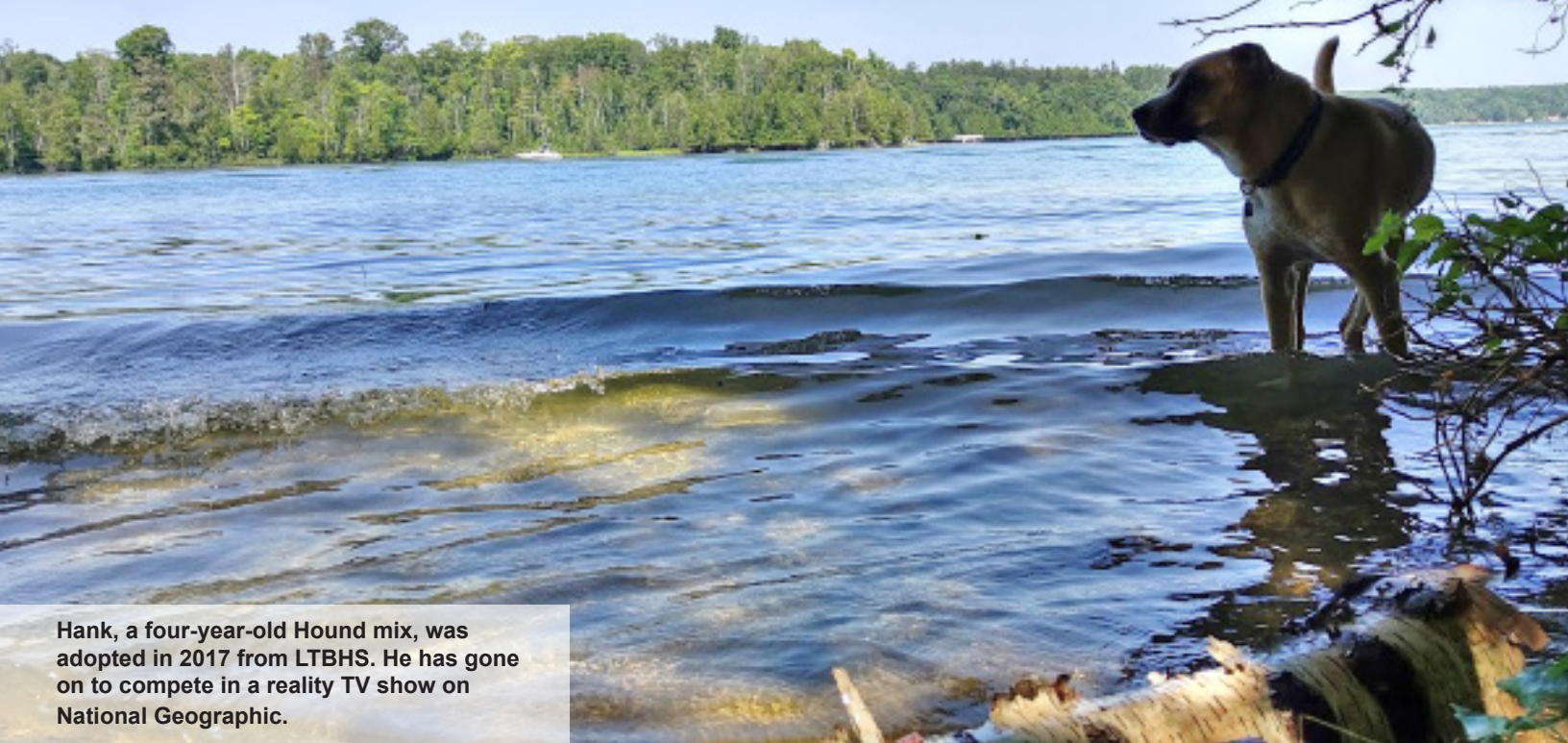
Hank, a four-year-old Hound mix, was adopted in 2017 from LTBHS. He has gone on to compete in a reality TV show on National Geographic.

Hank, adopted from LTBHS in 2017 (formerly Son), is another dog who has his owner's back. Hank recently starred with his owner's former boyfriend in the National Geographic series, Called to the Wild , where individuals and their dogs compete on a 10-day wilderness adventure (the dogs are fed daily and receive care by on-set veterinarians--it is only the people who must rely on themselves for food).